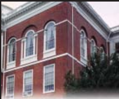
College residence hall

THE MODEL 1816 telephone intercom system is designed for commercial applications where communication and access control devices are necessary to provide two-way voice communication and control of a door or gate through a resident's own telephone – without the need of a dedicated central office phone line. This eliminates the need for costly hard-wired intercom systems, monthly line charges, and equipment lease payments.